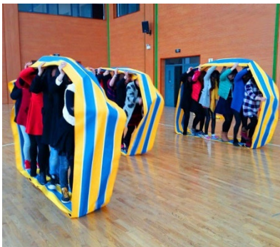
Figure 4. Run Mats