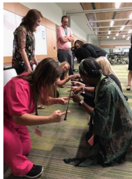
Figure 2. Helium Stick