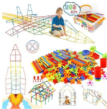
Figure 2. Constructor Kit