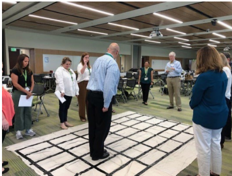
Figure 1. Maze Game