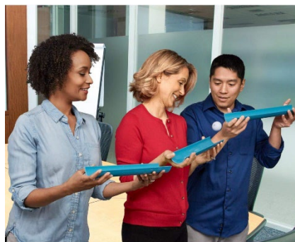
Figure 5. Pipeline Kit