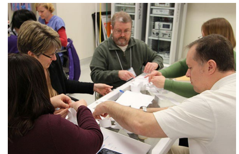
Figure 6. Paper Chain Building