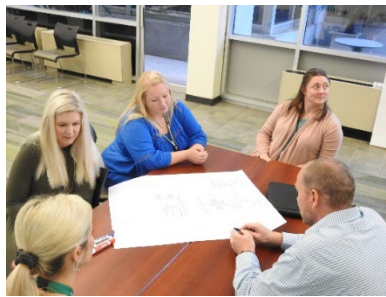
Figure 6. Professional Pictionary