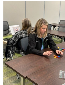
Figure 3. Dominoes Game