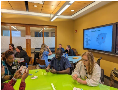
Figure 1. Barnga Game