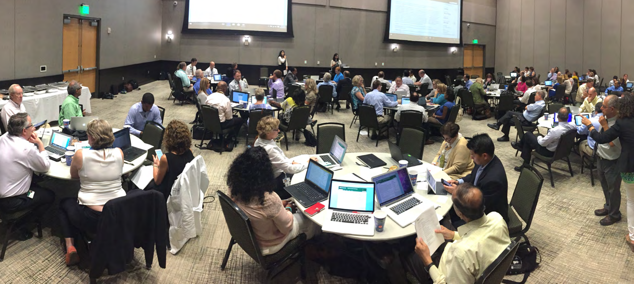
100 DOM Faculty Members Engage in Strategy Meeting Ideas from Innovation Challenge evaluated to shape 2016-2017 Department goals.