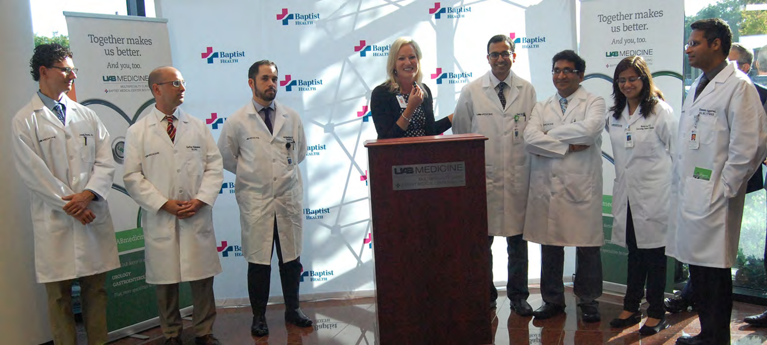
UAB Partners with Baptist South to Open New Clinic Endocrinology, Rheumatology, and GI physicians improve access to care in Montgomery.