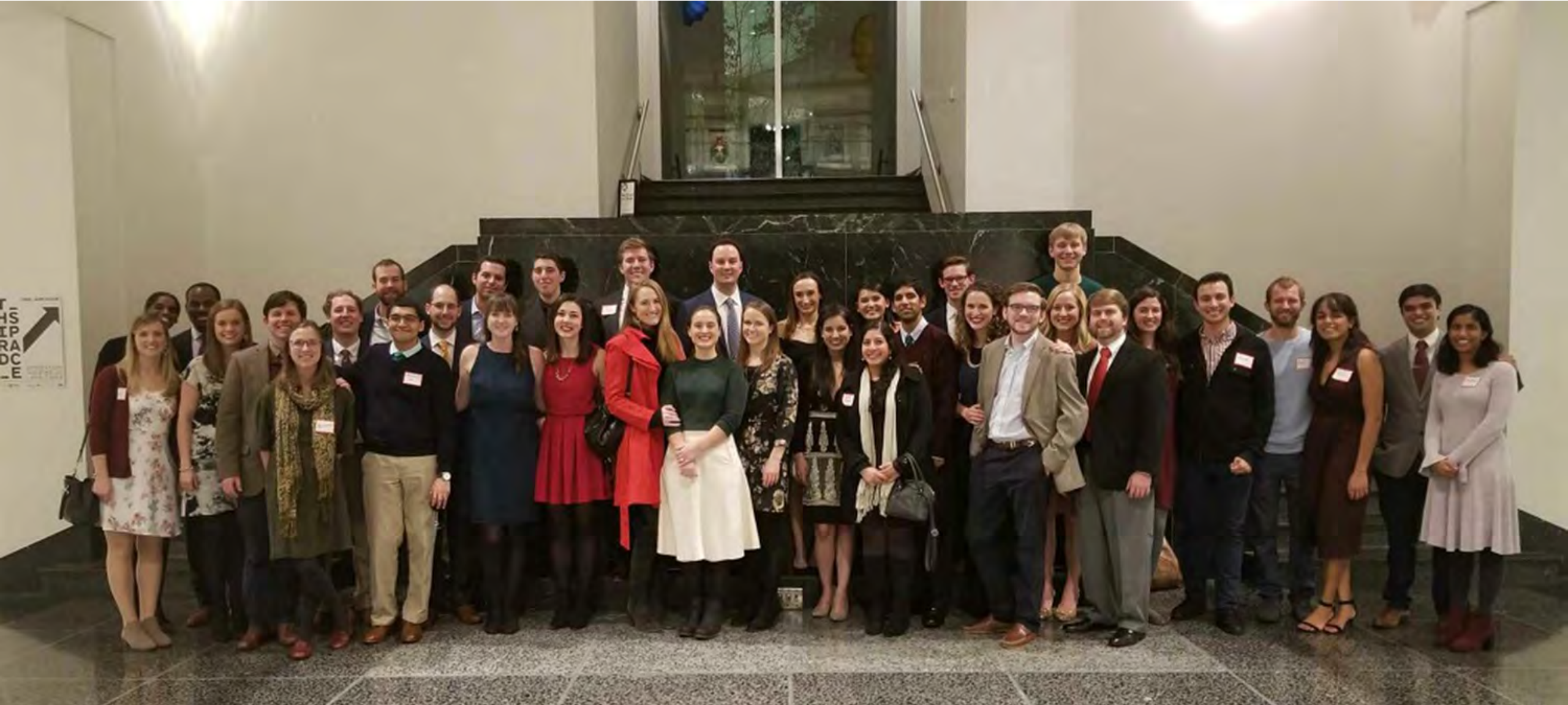
IM Residents Enjoy the Department of Medicine Holiday Celebration at the Birmingham Museum of Art!