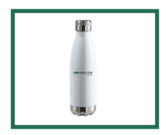
Water Bottle $21