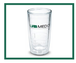
Tervis Tumbler $10