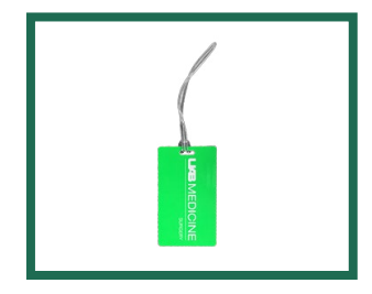
Luggage Tag $1