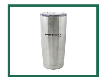
Metal Tumbler $15