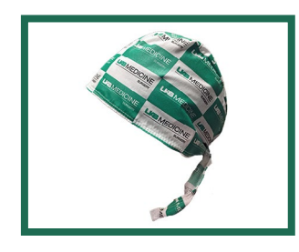
Scrub Cap $12